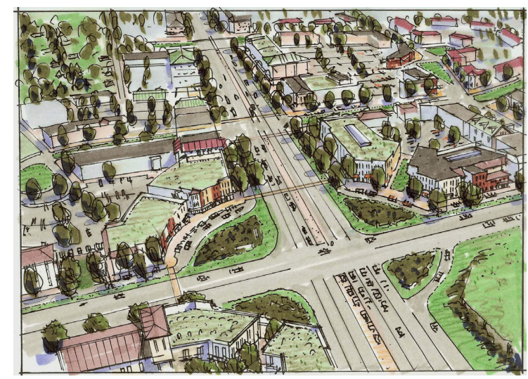
Aerial view of new gateway.