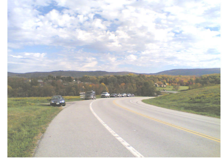
Existing view along Arnold Palmer Drive.